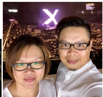
Us taking a photo before the concert